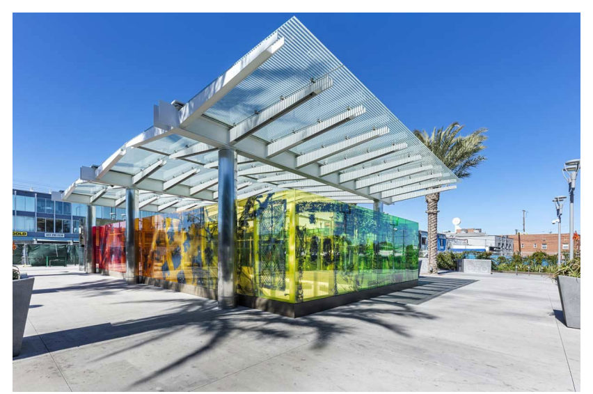
Design Award Winner: 2022 Best Decorative Glass Application from Glass Magazine