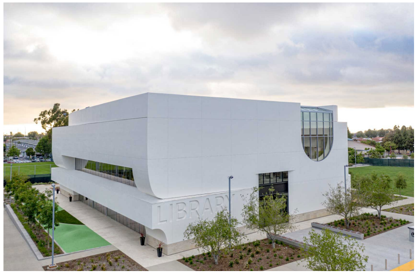
ENR California Best Project, 2021 Cultural/Worship